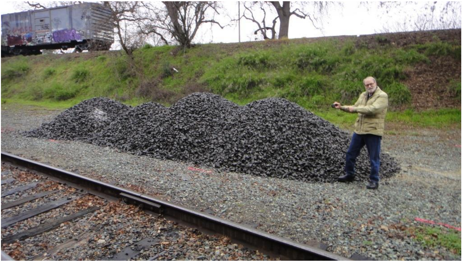
Alan celebrates the arrival of the first 50 tons of ballast rock