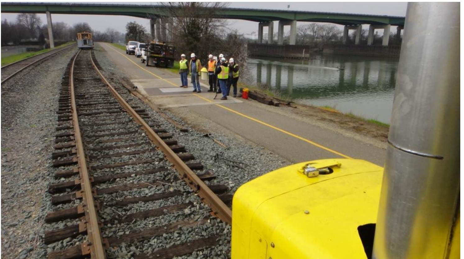
Pursuant to 49 CFR Part 214, the MOW Team stands aside in the designated safety zone as the tug heads back to Setzer for a refill of rock