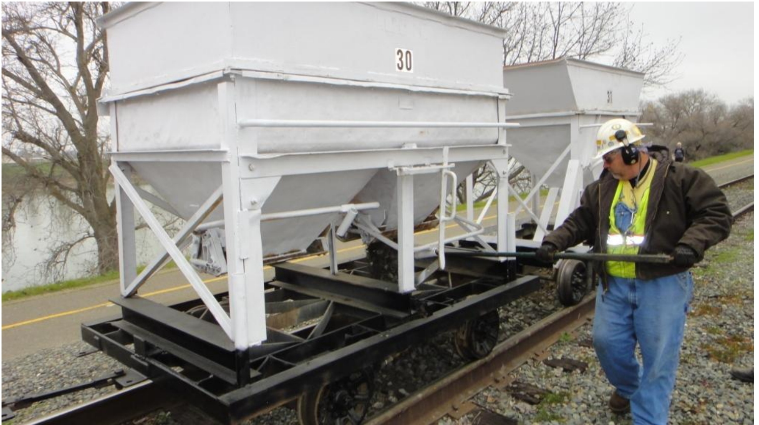
Mike F. opens the clamshells to release rock from the center dump ballast hopper