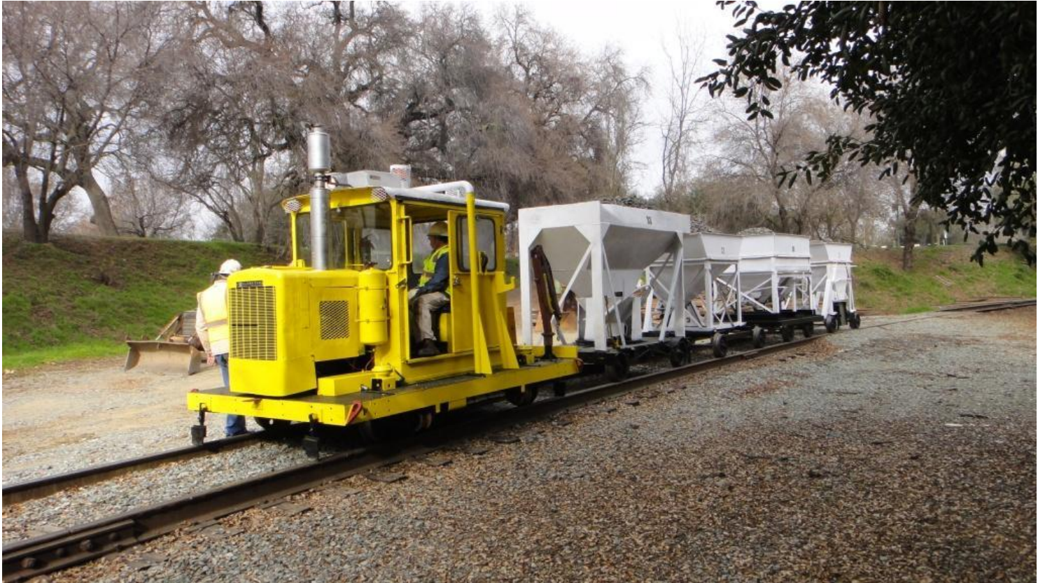
The Kalamazoo tug is ready to pull 15 tons of rock up the Setzer Grade